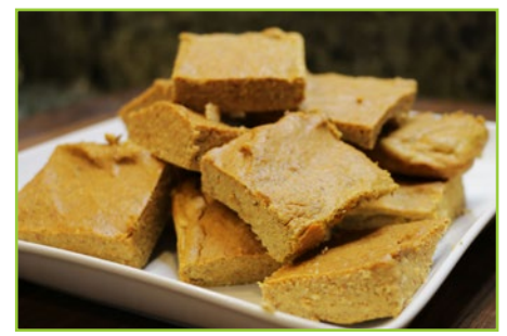
SWEET POTATO PROTEIN SQUARES 7p/7c/30f 317 cals 11p/12c/4f 128 cals