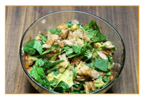
I-SEA-U GETTING LEAN TUNA BOWL

13p/38c/24f 420 cals 54p/21c/6f 505 cals 40p/22c/38f 590 cals