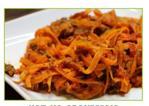
NOT YO GRANDMA'S PASTA

45p/12c/30f 498 cals 45p/12c/36f 552 cals 41p/54c/20f 560 cals