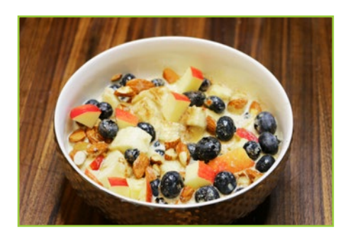
"CEREAL" & PROTEIN "MILK"

Eat these meals & snacks in any order at any time of day.