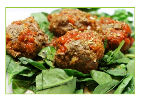
MUSCLE MAKING MEATBALLS

13p/38c/24f 420 cals 54p/21c/6f 505 cals 40p/22c/38f 590 cals