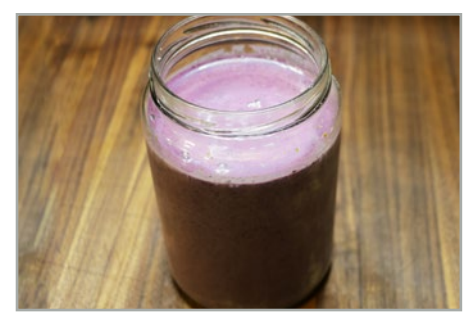
POST-WORKOUT GAINZ SHAKE 7p/7c/29f 317 cals 25p/50c/11f 399 cals

Drink this immediately post-workout, whenever your workout happens