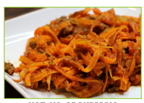
NOT YO GRANDMA'S PASTA

45p/12c/30f 498 cals 45p/12c/36f 552 cals 41p/54c/20f 560 cals