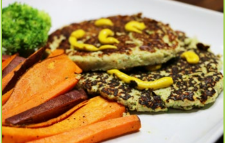
TUNA PATTIES & FRIES