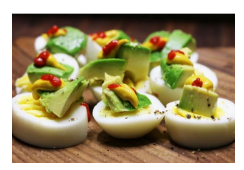
AVOCADO EGG CRACKERS