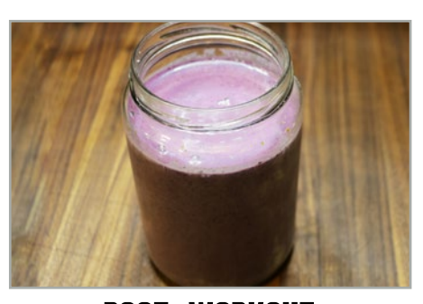
POST-WORKOUT GAINZ SHAKE