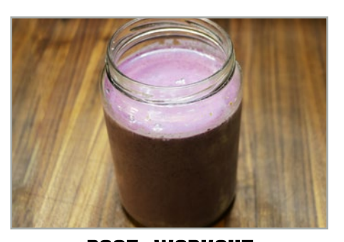
POST-WORKOUT GAINZ SHAKE