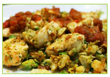
FAST WOK TO GAINZVILLE