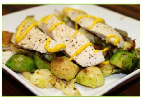
CHICKEN FINGERS & BRUSSELS 4 MUSCLES

28p/41c/11f 375 cals 41p/8c/9f 277 cals 39p/38c/37f 641 cals