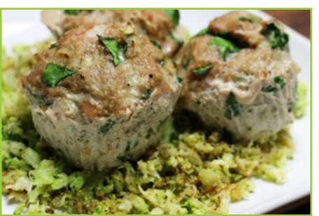
TURKEY MUFFINS & BROCCO-RICE