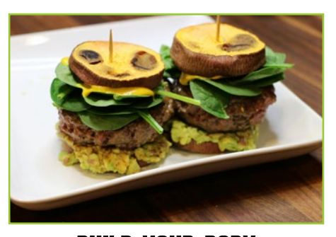
BUILD YOUR BODY BURGERS