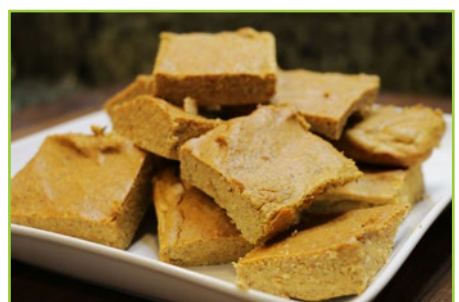
SWEET POTATO PROTEIN SQUARES