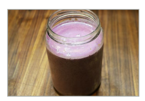
POST-WORKOUT GAINZ SHAKE