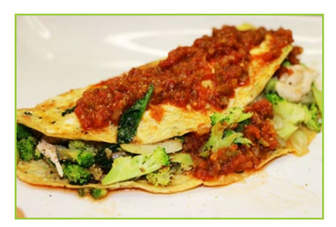
THE REAL BREAKFAST OF CHAMPIONS

Eat these meals & snacks in any order at any time of day.