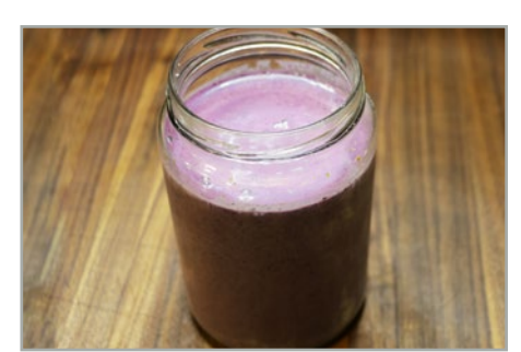
POST-WORKOUT GAINZ SHAKE

48p/11c/11f 335 cals 25p/50c/11f 399 cals